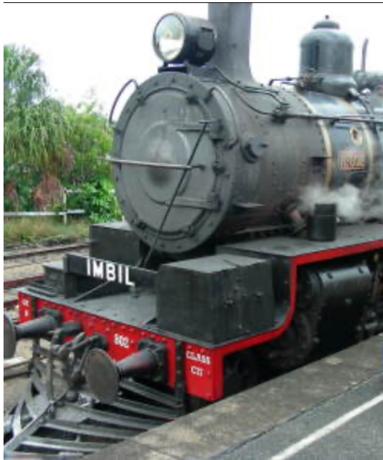
Fun on the Mary Rattler steam train