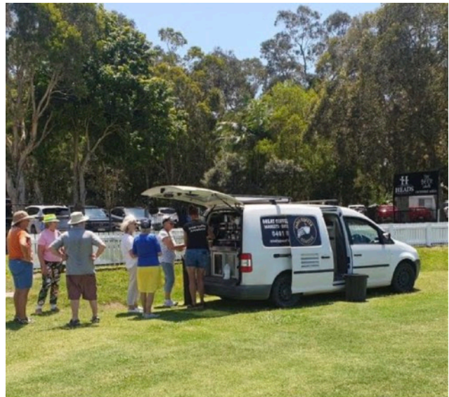
All four PROBUS Clubs celebrating Probus Day