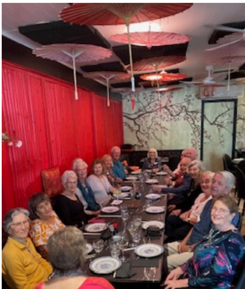
A wonderful lunch at Chinadina