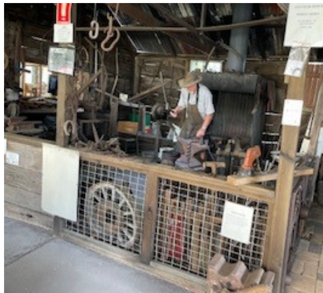
BLACKSMITH AT THE HISTORIC VILLAGE