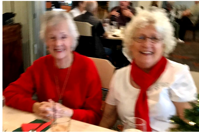
Apology for the blurriness could not correct it