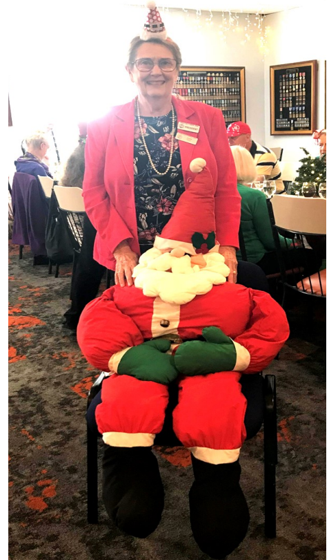
"It's that man again" >>>>>