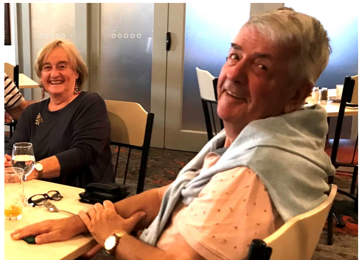
Continued next page