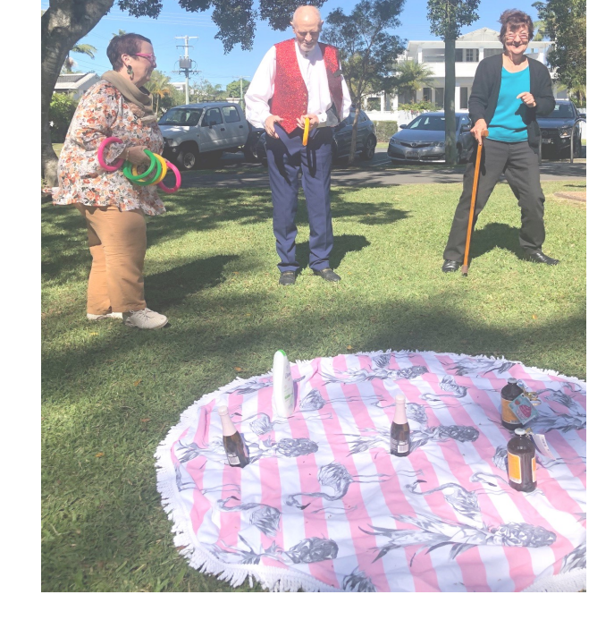
Winners are grinners