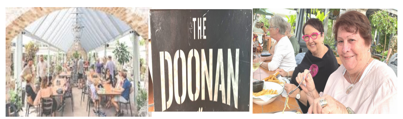
Enjoyed the Mothers day lunch at "The Doonan" immensely, the food was delicious will definitely go back. The staff were very helpful and attentive even the guy from the Bottle shop pushed Trish's wheelchair to the dining area for me, only disappointing thing was I was the only male along with eight ladies Thank you ladies for your company.