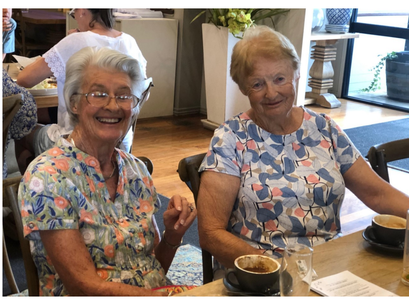
Lunch at Cooroy Hotel cont