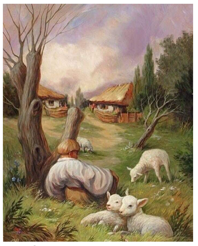
Strange what the eye sees !!!!!!