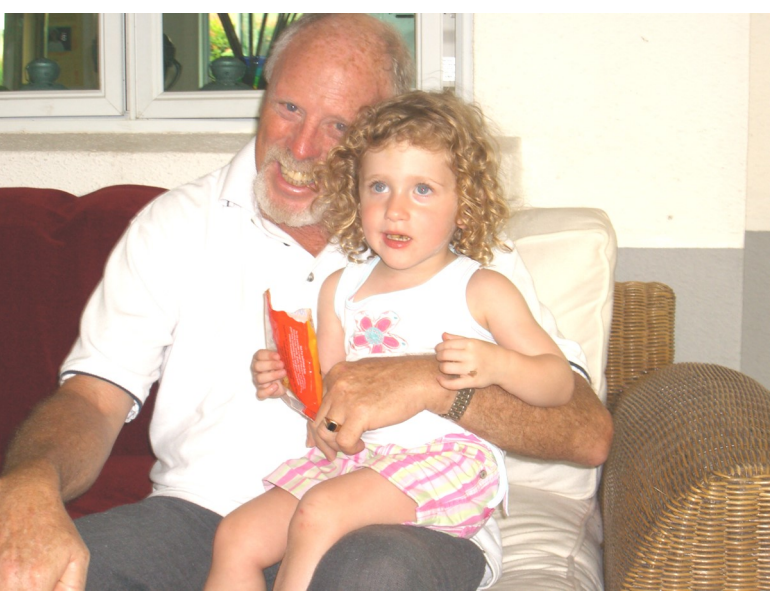
The things you do in Singapore during wet weather one of which is Grandad sitting !!!!