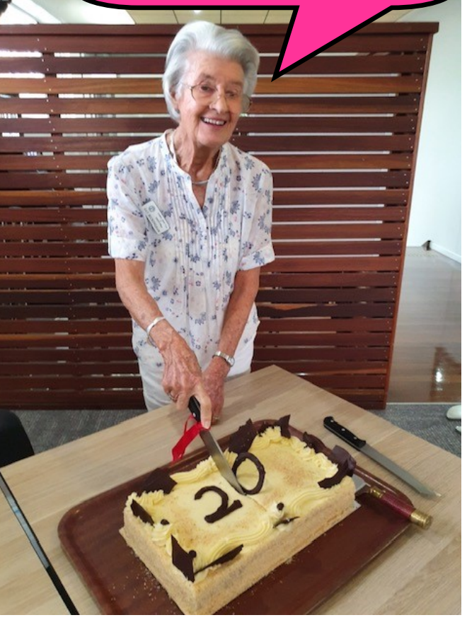
Cutting the cake in honour of the clubs 20th anniversary at the lunch at Tewantin Golf Club